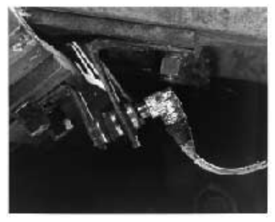
Photo 1. A 18mm prox with Cushioned Sensor Mount installed below a sawmill "Stop-N-Loader".

Not all machinery systems are built to exacting standards. Precision can be expensive and over-kill, whether a new design or trying to maintain one. When plus or minus a ¼" works, even the versatile inductive proximity sensor can be successfully applied. Using a spring-return mounting bracket, sensor damage due to worn machine components, or low precision mechanisms can be solved quickly, and without expensive machine repairs.