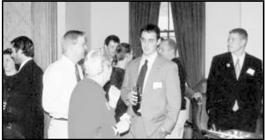
Mohawk Valley Prowlers players socialize with Chamber members and loyal fans at a social hosted by the Mohawk Valley Chamber of Commerce. The Prowlers, members of the United Hockey League, began their season on October 15.