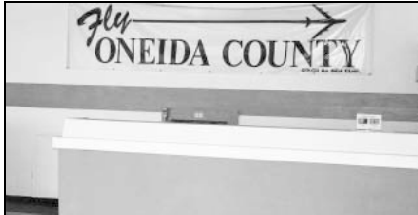
A deserted reservation desk at the Oneida County Airport demonstrates the lack of people who currently "Fly Oneida County." Strategies for Airports and the Chamber of Commerce hope to remedy the situation in the coming months.

The Mohawk Valley Chamber of Commerce has adopted the Oneida County Airport after an extensive survey revealed a potential $200 million market for the facility.